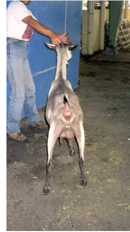
As a Yearling