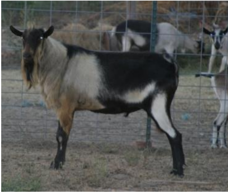
As a Yearling