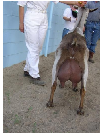
As a 7-Year Old with 5 Lactations