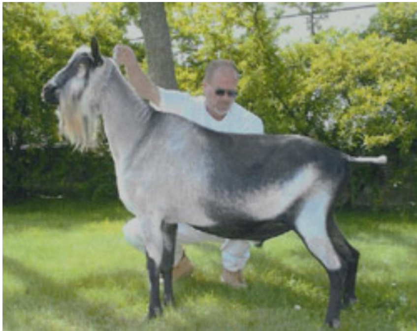
As a Mature Buck